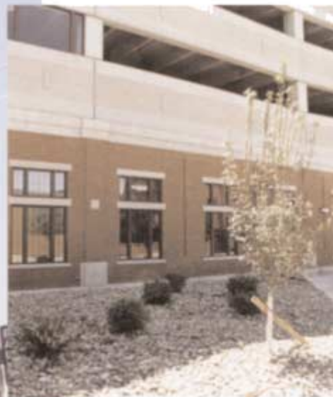
The new Parkersburg, W. Va., intermodal/mixed-use parking facility was produced on a design-build contract. It features an all-precast concrete structural system that helped meet the deadline and budget.

Criteria Developer who, acting on behalf of the agency, develops both the building concept and the request for proposals (RFP).