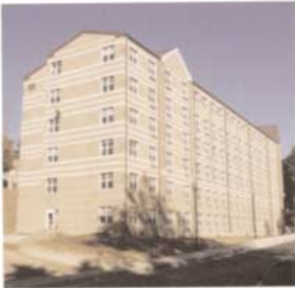
This 400-room dormitory at Fairmont State University was completed in 13 months, thanks to the design-build process. The project features precast concrete hollowcore slabs, which sped construction and saved material.

The ability of precasters to begin designing and casting components while finish drawings are completed works well within the design-build system. In addition, casting can continue while site work progresses,